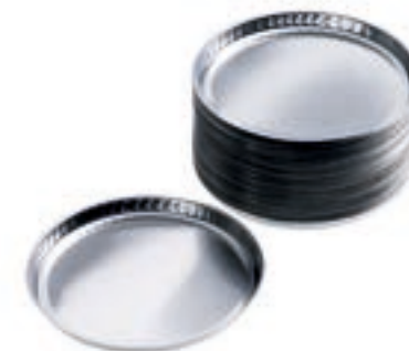
PANS FOR MOISTURE ANALYZERS