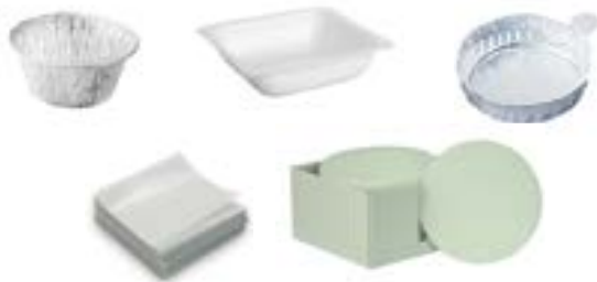
WEIGHING BOATS & GLASS FIBERS PLATES