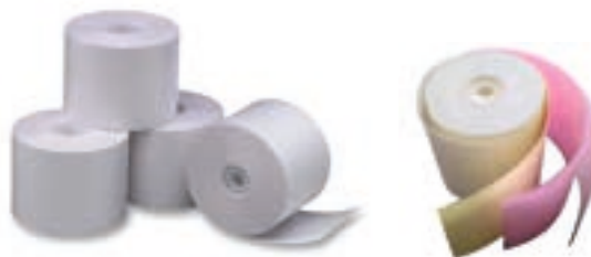
DOT MATRIX & THERMAL PAPER ROLLS IN CUSTOMIZED SIZES