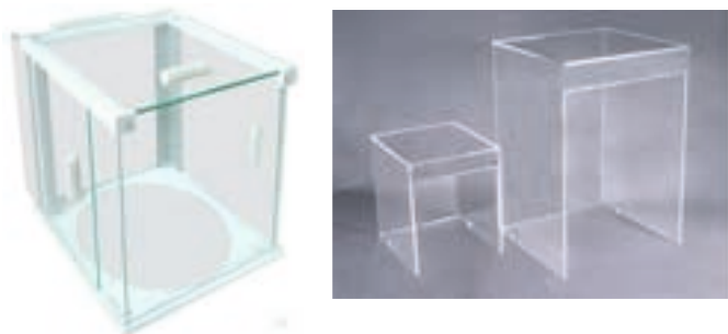
GLASS DRAFT SHIELDS FOR LAB BALANCES